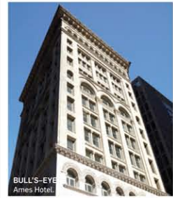
BULL'S-EYE: Ames Hotel. AMES HOTEL, BOSTON ameshotel.com