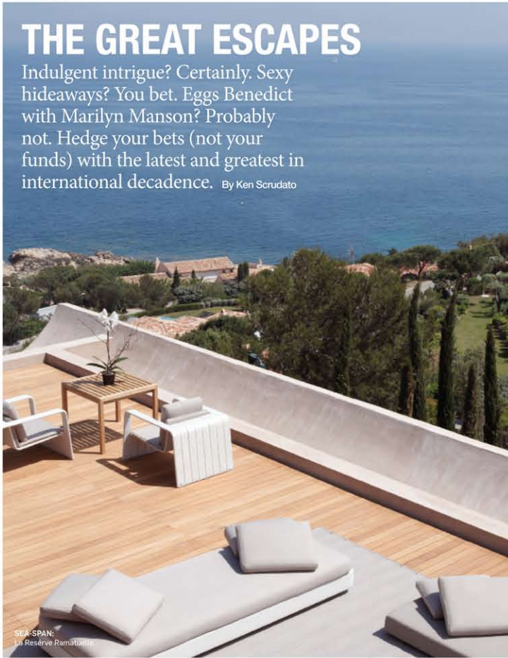
SEA-SPAN: La Réserve Ramatuelle