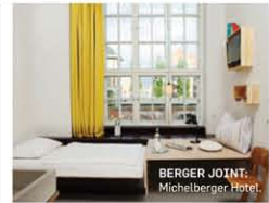
BERGER JOINT: Michelberger Hotel MICHELBERGER HOTEL BERLIN, michelbergerhotel.com