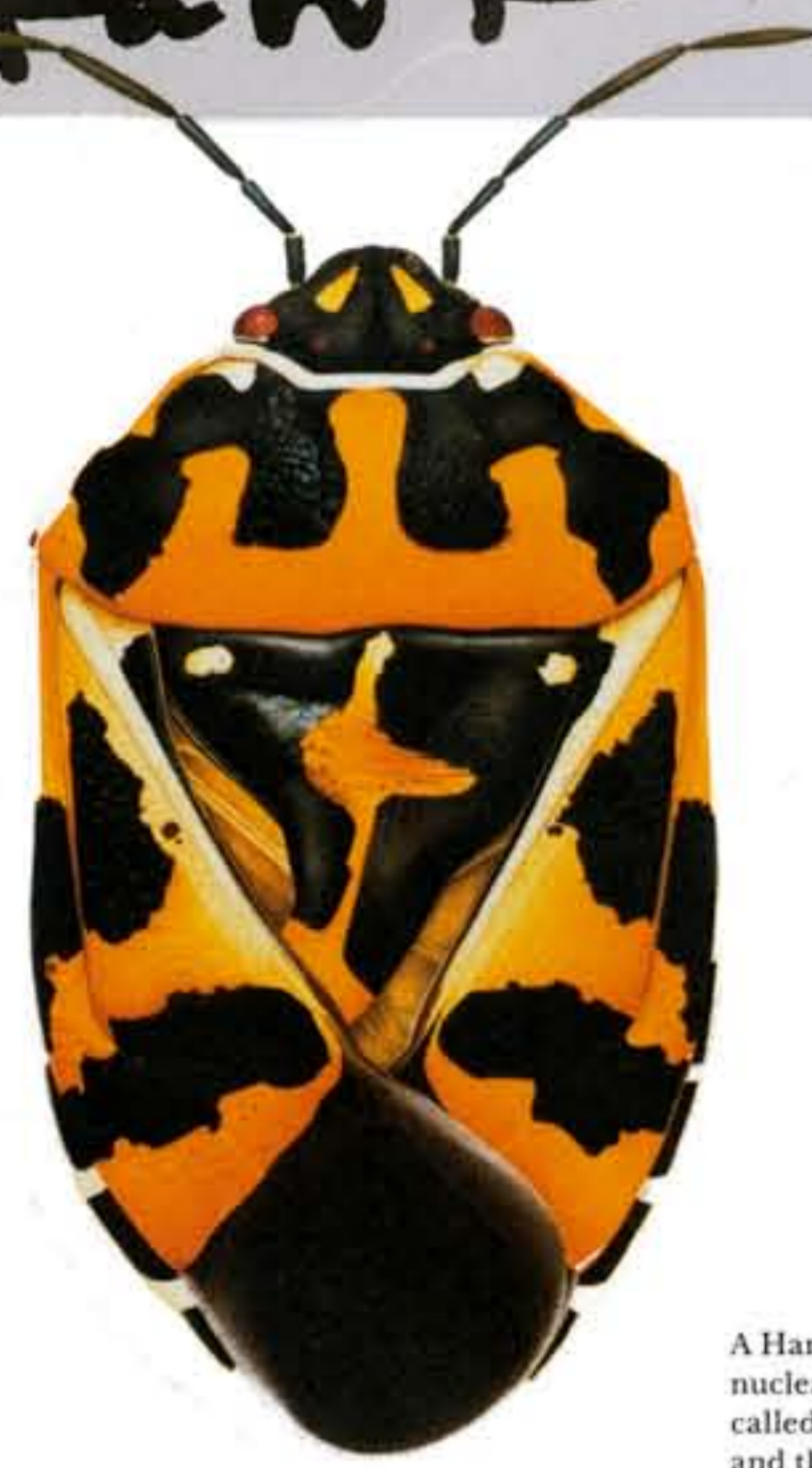
A Harlequin Bug collected near a nuclear power plant in Three Mile Island called Governor's Stable. The shield is bent and the yellow form is asymmetrical.